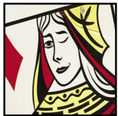
Detail: Color Thermal