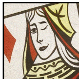
Detail: Ink Jet